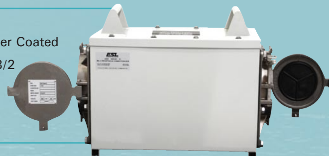
Portable Shore Power Pass-through Extension Box Cat. No. E2-500-500-520005