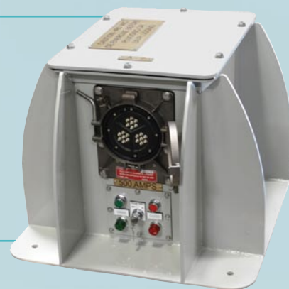
2-Gang Shore Power Box Cat. No. E2/1-R500-500-MIL-C-24368/2-222055