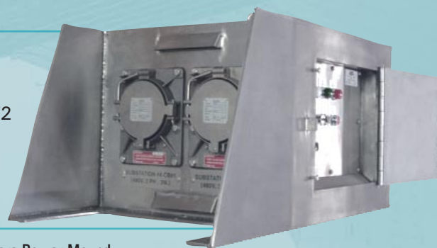
2-Gang Shore Power Mound Cat. No. E2-R500-480-MIL-C-24368-221506