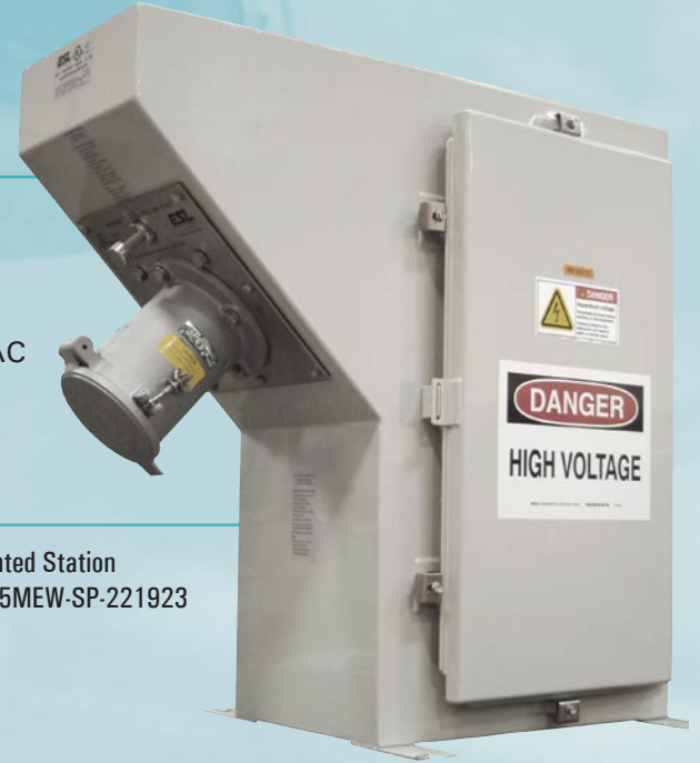
1-Gang Pedestal Mounted Station Cat. No. E1-R200-480-200-65MEW-SP-221923