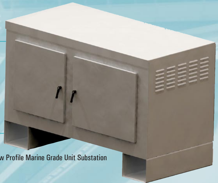
Low Profile Marine Grade Unit Substation