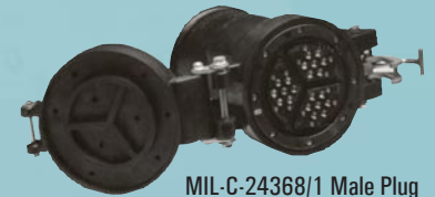
MIL-C-24368/1 Male Plug