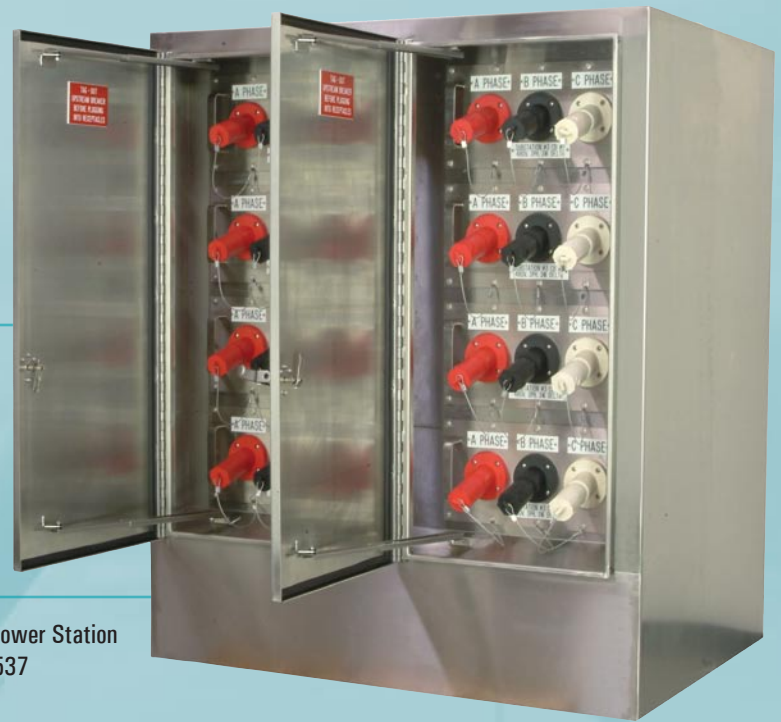
8-Gang Mil-Spec Single Pole Shore Power Station Cat. No. E8-500-480-221537