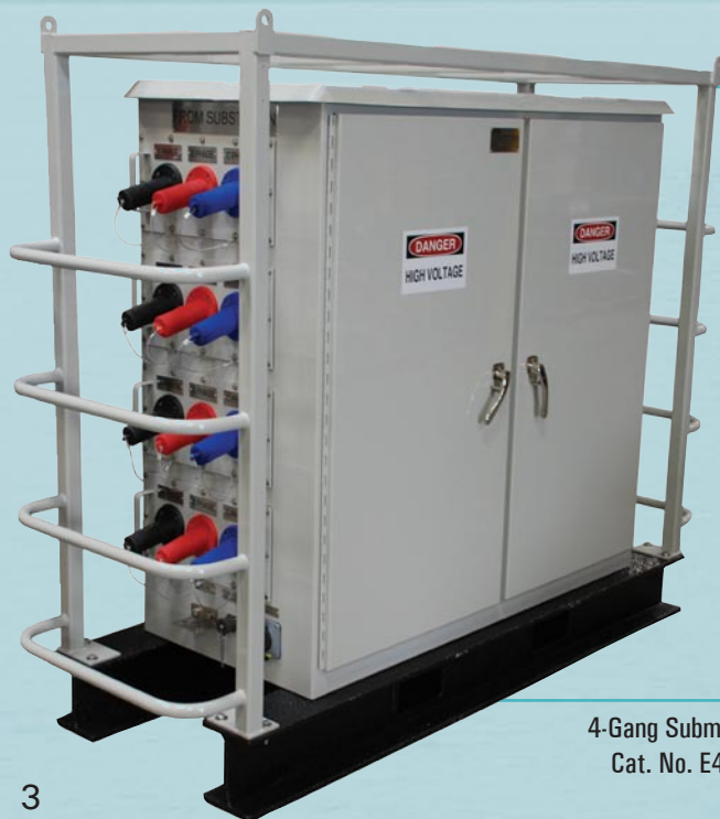
4-Gang Submarine Hookup Station Cat. No. E4-690-480-520001