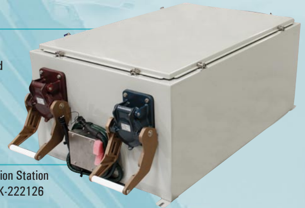
2-Gang AMP™ Connection Station Cat. No. E2-R380-7.2K-222126