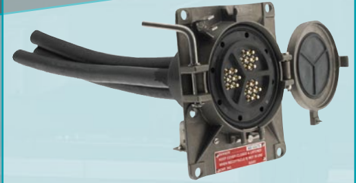
MIL-C-24368/2 Receptacle with Factory-potted Cables