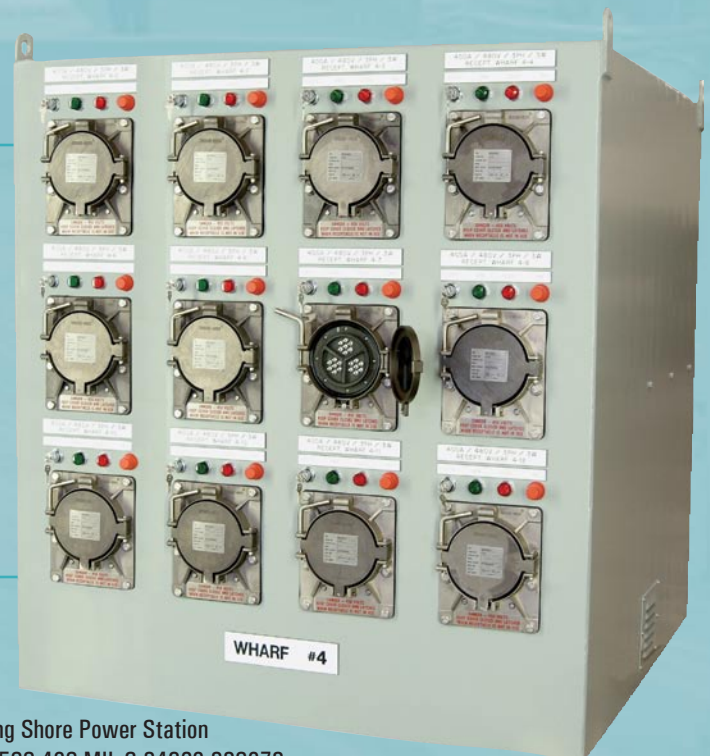
12-Gang Shore Power Station Cat. No. E12-R500-480-MIL-C-24368-220872